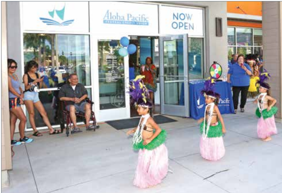
Keiki dancers from Aumakua Productions performed at the grand opening of APFCU's Kahului branch in the Pu'unene Shopping Center.

For more information, go to any of our websites. Mahalo!