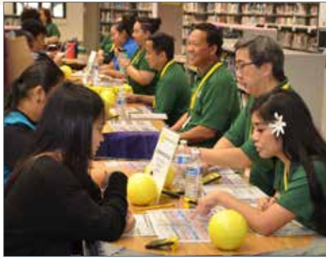
Farrington High School students at the Get REAL Financial Reality Fair were presented with various spending choices that would affect their budget.

nuska Valley FCU, which also has a branch in Waipahu.