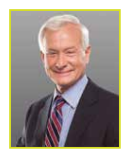
Kirk Caldwell Mayor, City and County of Honolulu