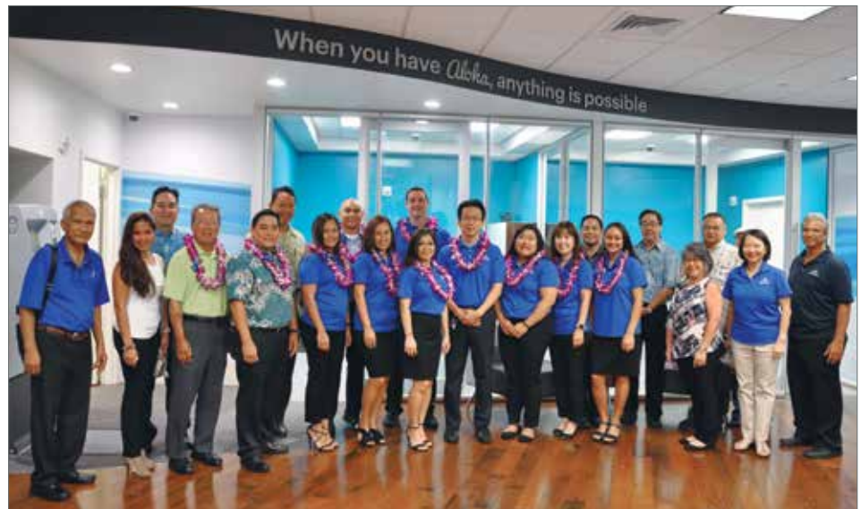
APFCU staff, Board members and guests attended an informal re-opening ceremony September 17 at the Fort Street branch. The Remote Teller System has been removed in favor of new face-to-face teller pods and offices for private consultation.