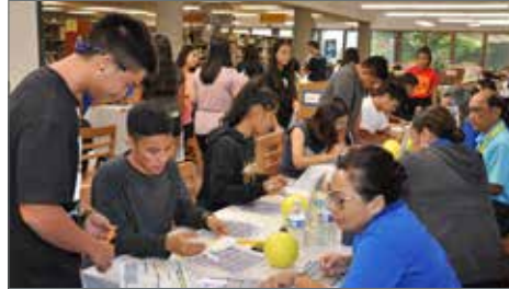
McKinley students consider the options, and the costs, of cell phone/internet/cable TV plans at the October 24 Get REAL fair in the school’s library.

The fair was created by Alaska’s Matanuska Valley FCU, which also has a branch in Waipahu. APFCU is proud to partner with Matanuska Valley FCU as we invest in the young people of our community and help them prepare for a successful financial future.