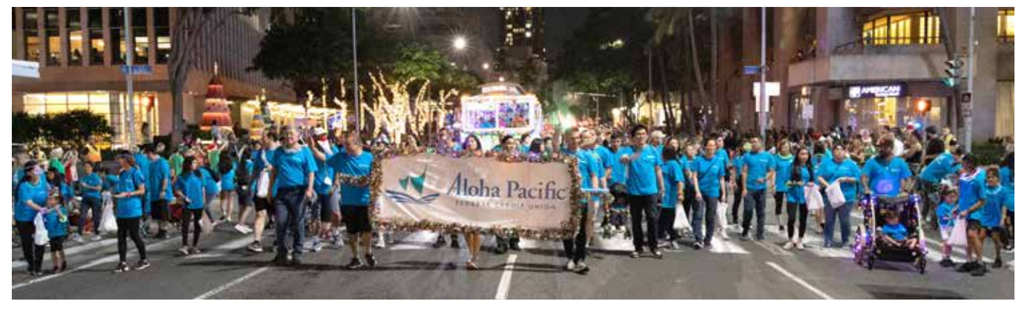
The Aloha Pacific team passes out candy to the crowds on King Street during the Electric Light Parade.