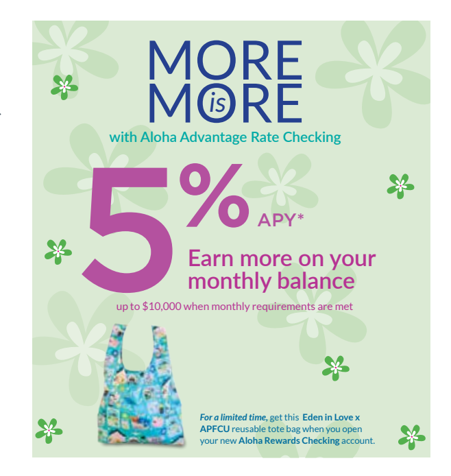
* Effective 1/1/24. Membership ($5 in Regular Savings) required. Earn 5% Annual Percentage Yield (APY) on your average daily balance up to $10,000 if monthly requirements are met. 0.03% APY will be paid if monthly requirements are not met. Terms and conditions subject to change. See branch for current rates and details. Limit: One Eden in Love collab bag per member. Some restrictions apply.

All these requirements are waived for the first three months when you open your new account!