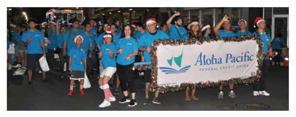
Marching on South King Street is always a thrill for our Aloha Pacific FCU team of employees, family and friends.

We hope you all had a wonderful holiday!